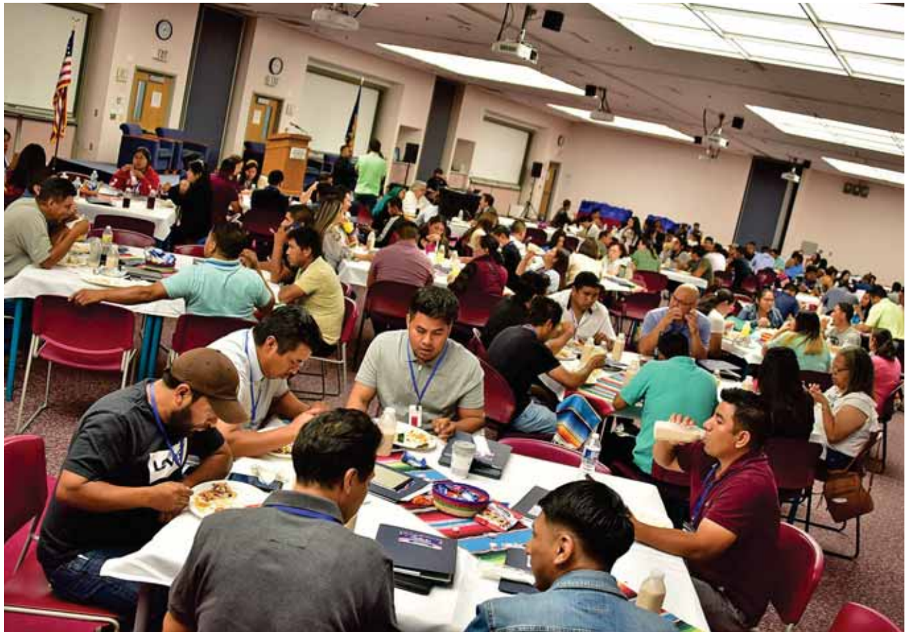
Vista general de la cumbre de empresarios de Sussex

En los últimos 15 años, Arshnt-Cannon Fund ha invertido más de $11 millones en programas educativos para apoyar a la comunidad latina de Delaware.